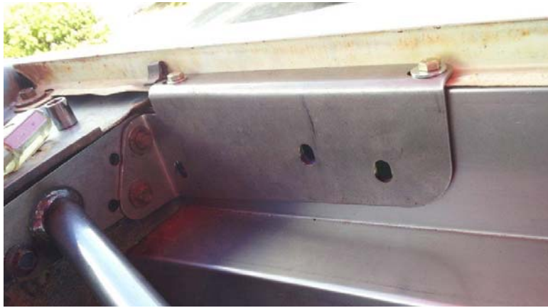
Figure 1 - Hood Hinge Brace & Fender Install